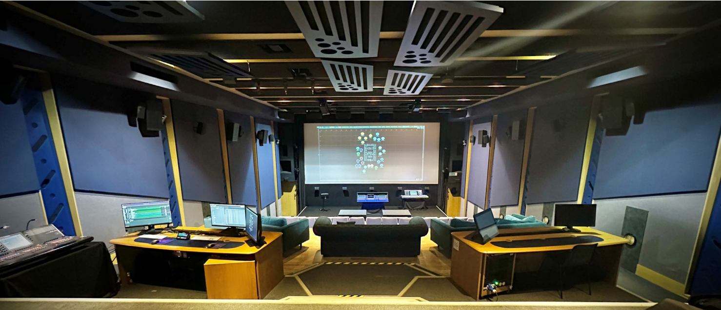
Top: Wembley Stadium. Above: Southby's Soho London Soundscape Studios

for artists such as Chase & Status and Groove Armada to shows with orchestras like the Royal Philharmonic Orchestra, the company deals at the very top end of the industry, and is proud to do so across a wide range of different genres.